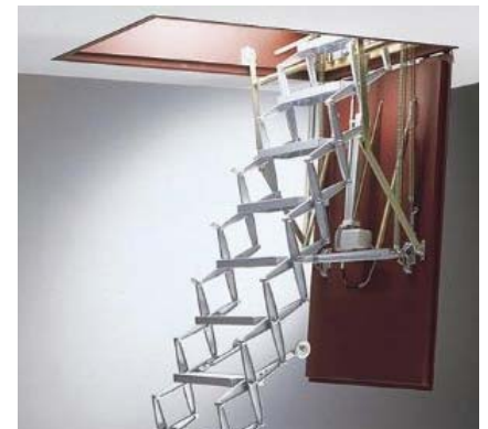
Superior Stairway with steel fire resistant casing, electrically operated.